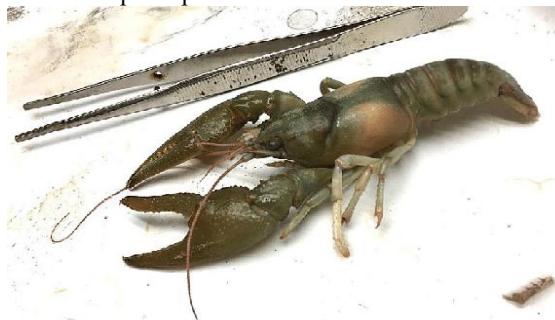
Figure 1: Image of a typical crayfish

Crayfish, a specimen of which is shown in Figure 1, are a very common type of crustacean that is eaten all over the world. There are some 150 crayfish species in North America, over 540 species worldwide. 1 They can be found in creeks and rivers in the US, from Michigan in the north to Florida in the south, and from the Americas to Eurasia. They are typically found in burrows near water or underneath rocks in creeks. As a creature that grows to no more than a foot in length, they usually feed on animal carcasses that they encounter or on aquatic plants.