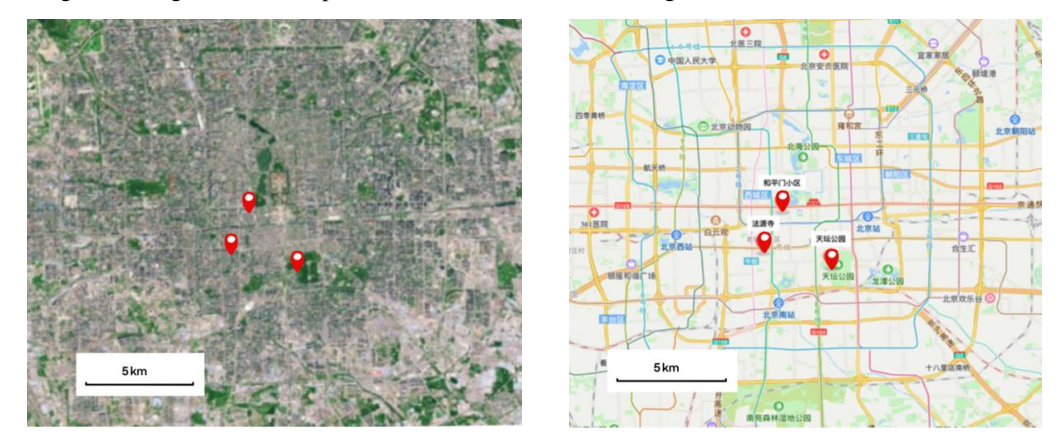
Figure 1 Schematic representation of the location of the study area

The study area for this experiment is located in the urban area of Beijing, and different representative urban green spaces in highly urbanized areas were selected. Beijing is located in the northern part of the North China Plain, bordered by the Huanghuaihai Plain in the south, the Shanxi Plateau in the west, and the Inner Mongolia Plateau in the north, with a total area of 16,400,000 m<sup>2</sup>. The Beijing area has a warm-temperate monsoon climate, with arid and windy springs, high temperatures and heavy rainfalls in summers, cool and humid autumns, and cold and dry winters, plus the changes of the four seasons are clearly defined. According to the data of China Meteorological Administration, the average annual rainfall in Beijing is 532.1 mm, which is concentrated in summer, and the average annual temperature is 12.6 °C, with an average temperature of -3 °C in January and 27.3 °C in July<sup>[7]</sup>. The three urban green areas selected for this study are Tiantan Park, Fayuan Temple and Hepingmen neighborhood green belt, the specific locations are shown in the figure below.