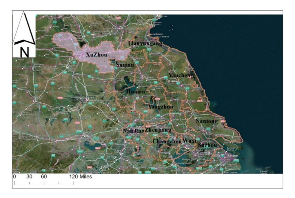
Figure 1 Location Map of Xuzhou City