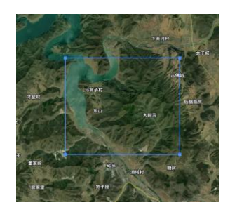
Figure 1 Data area